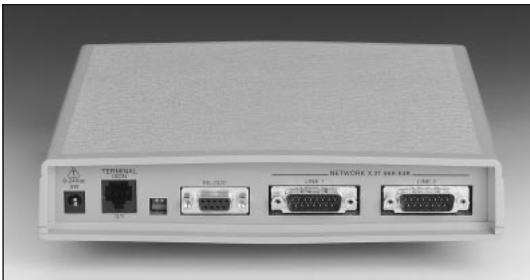
TS-264 Rear Panel